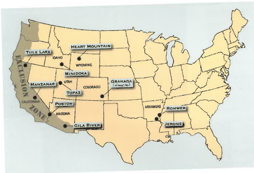
Map of ten WRA camps and exclusion zone.

Historical archaeology, which combines memory, documents, and the physical evidence of the past, is a powerful way to better understand how people create places. Since 2008, I have led intensive archaeological study of the Amache landscape which has taken place primarily during biannual archaeology field schools. One of my guiding research topics has been how internees were taking their expertise in growing things and applying it to an entirely new environment, the High Plains. I am also interested in what these landscapes reveal about the translation of Japanese and Japanese-American values and aesthetics in a situation of upheaval and shortage.