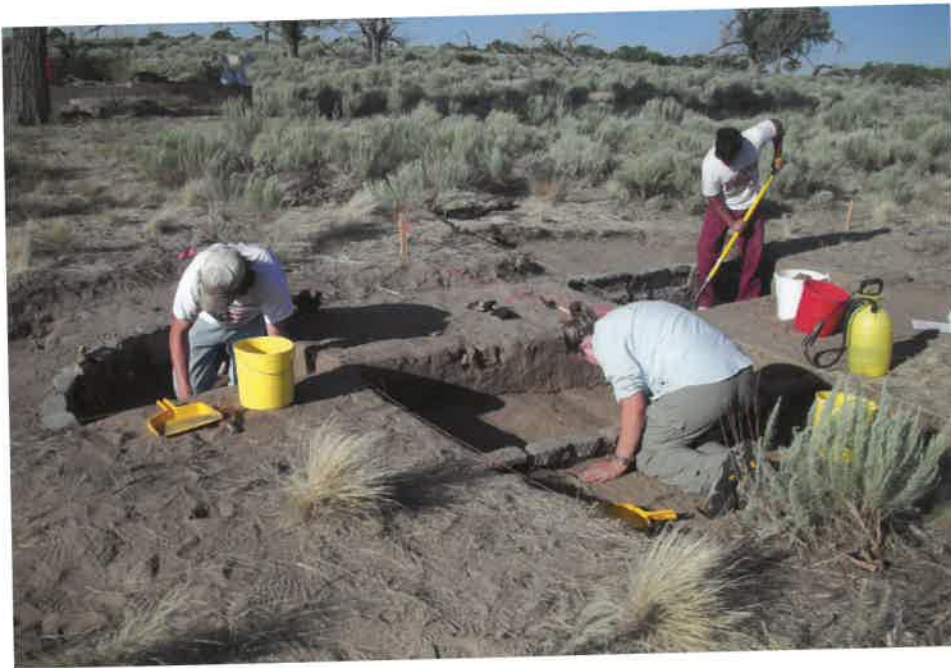
Garden excavation in progress, Summer 2008.

entryway gardens are not only the most common at Amache, they are also idiosyncratic and complex. Taking a closer look at them provides evidence of the expertise, strategies, and networks internees employed as they remade an environment none of them chose to inhabit. They also reveal the translation of Japanese gardening traditions in a setting where traditional plants and materials were often not available.