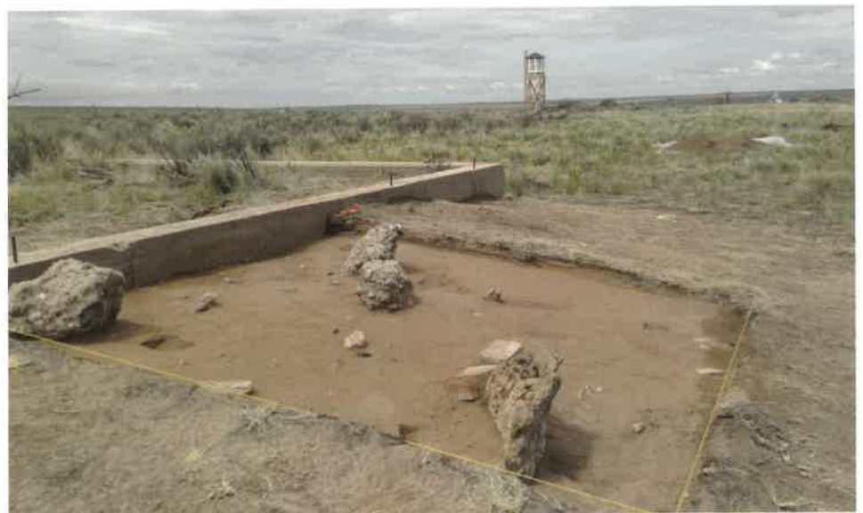
Karesansui garden with reconstructed guard tower in background, Summer 2014.

Most of the entryway gardens at camp were created by adults, but the younger generation of internees was also involved in efforts to landscape the camp. An article published by the school administrators indicated that the