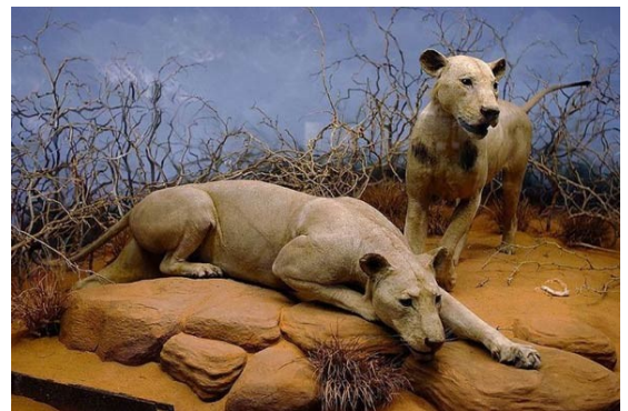
Professors Archer and Uttaro: The infamous "Man-Eaters of Tsavo"

To learn more about each program, contact baints@du.edu