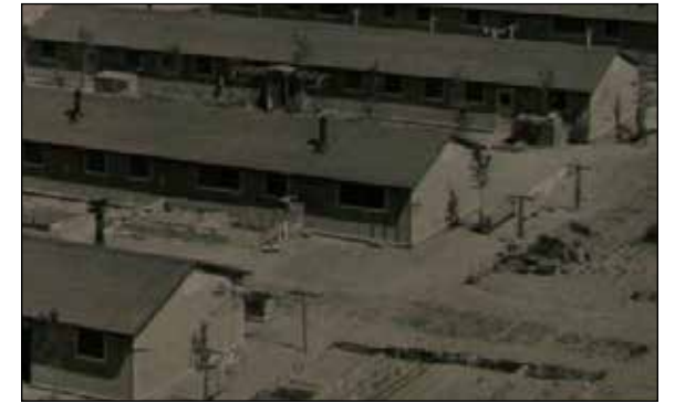
Victory Gardens in Block 12K at Amache

Why is this important though? What can gardens tell us about the past? To gain a better understanding of the past we have to delve into various lines of evidence, not just archaeological, to gain a better understanding of their lives of the internees and prisoners and their outlook on the war and their circumstances of the time.