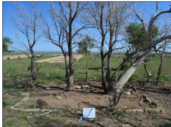
Officers Garden at Camp Trinidad, Summer 2013

space gardens, and entranceway gardens. The officer gardens were the most intricate and extravagant gardens that we found. They formed a semicircular shape just outside of the officer's club entrances and contained iris and basalt stones. Sometimes they even contained trees. The common space gardens could be found in various places throughout the camp and varied in size and shape. One of the most prevalent ones that we found was along a walkway and was in a triangular shape. The last type of garden that we found was entryway gardens that could be found outside of various barracks. These gardens were rectangular in shape and contained non-local flora (such as iris). It is interesting to compare the similarities and differences between the gardens found at these two locations.