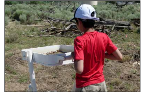
Visitor helping to screen at Amache

We know it's not possible for all of you to come to Colorado, but your input is vital to this project. This year we will continue research on the gardens, but also will be investigating what we think was a furo, or traditional Japanese bath. If you or a family member remember a furo at Amache, we would love to hear from you!