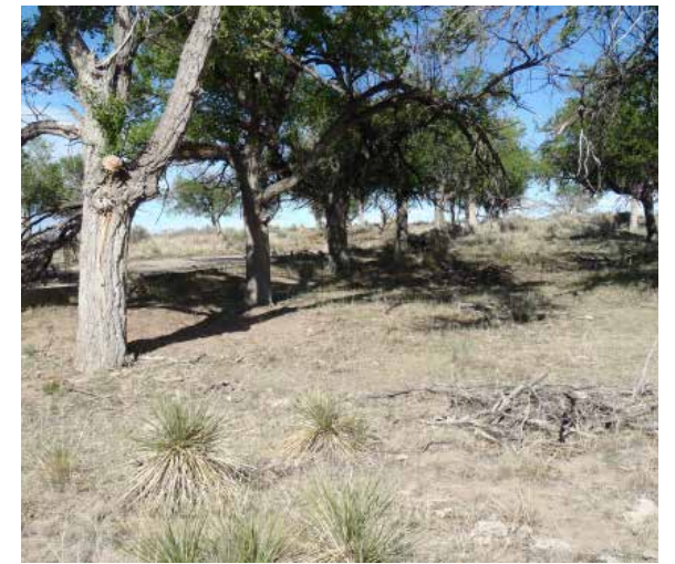
Trees still growing in an Amache barracks block