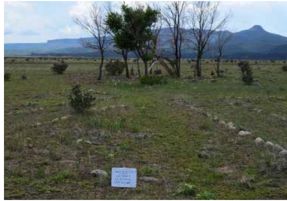
Triangle Garden at Camp Trinidad, Summer 2013

According to an oral history with a former Camp Trinidad prisoner, some of the prisoners cared deeply about beautifying the camp, and would compete with other gardeners, while other prisoners simply did not care. Three types of gardens were found at Trinidad. We found officer gardens, common