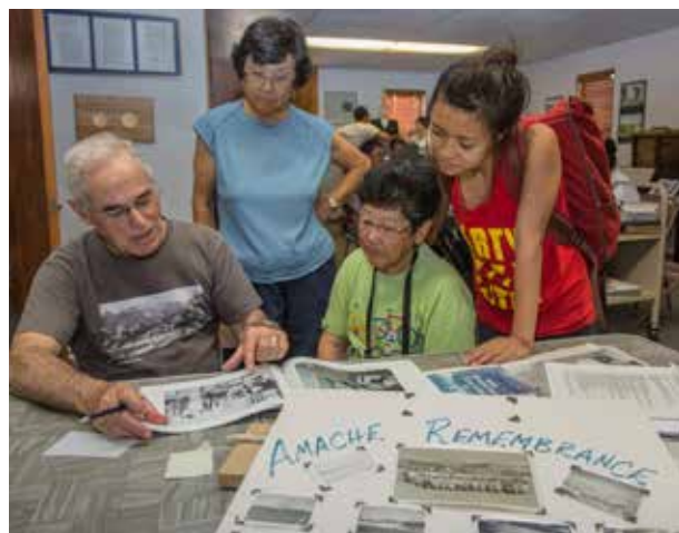
At the Amache Museum, Summer 2012

opportunity for visitors to see the results of our research and to meet other Amacheans. More details about that open house are also available in the newsletter. Of course we welcome visitors any time during our four weeks at Amache.