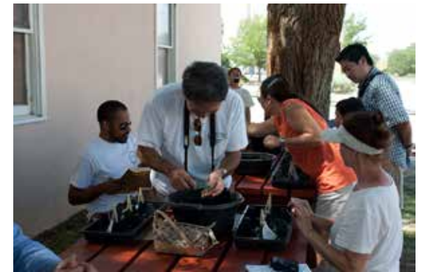
Visitors and crew wash objects from Amache at the 2012 Open House

The DU Amache project is looking for a high school or college student intern from the Amache community for the 2014 Field season! For more information or to apply, go to: