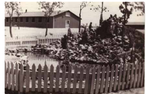
Garden at Amache (Block 6H) with river cobble landscaping