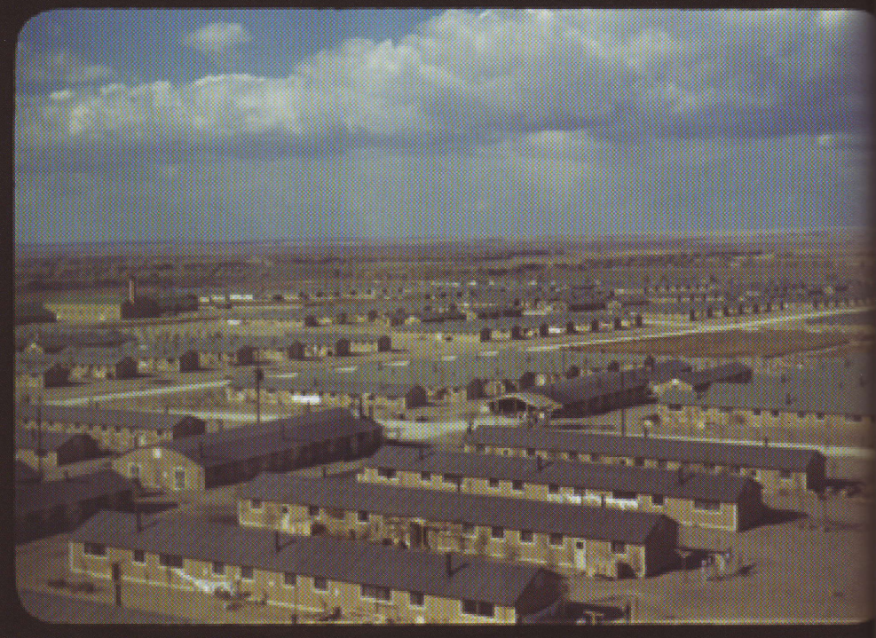
Historic Amache: (top, left to right) a Boy Scout troop, internees playing baseball, working the harvest at Amache farm, and (above) an overview of the camp as seen from the watertower

A barrack in Stonington, more than a hundred miles away, has been donated back to Amache, but the problem is finding the $100,000-plus to move it.