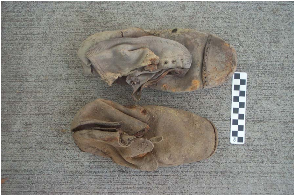
Recovered artifact: leather shoes.