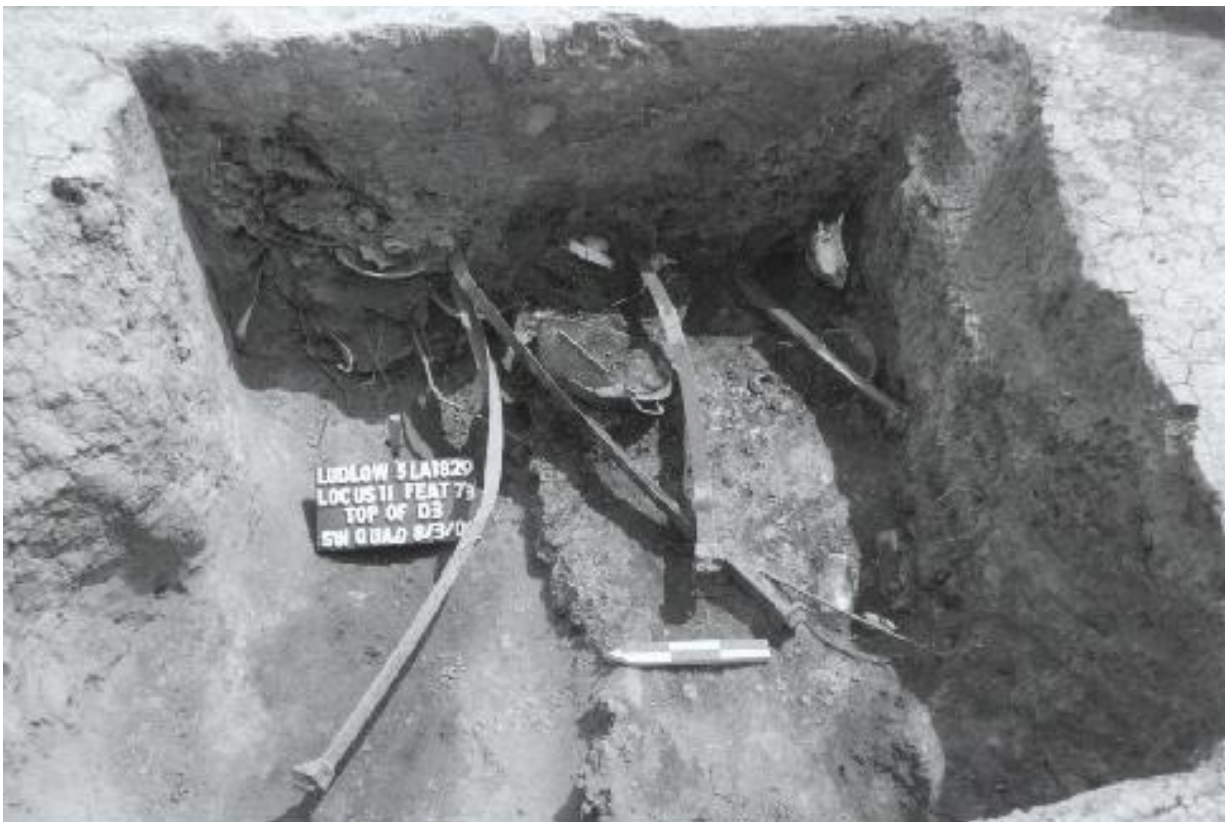
Tent cellar excavation, Locus 11, Feature 73.