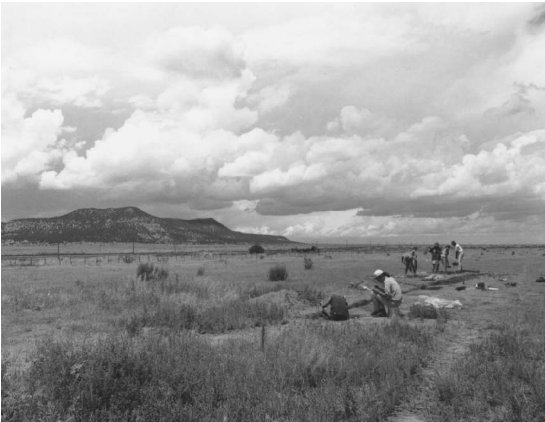
Archeological fieldwork. Locus 1 vicinity.