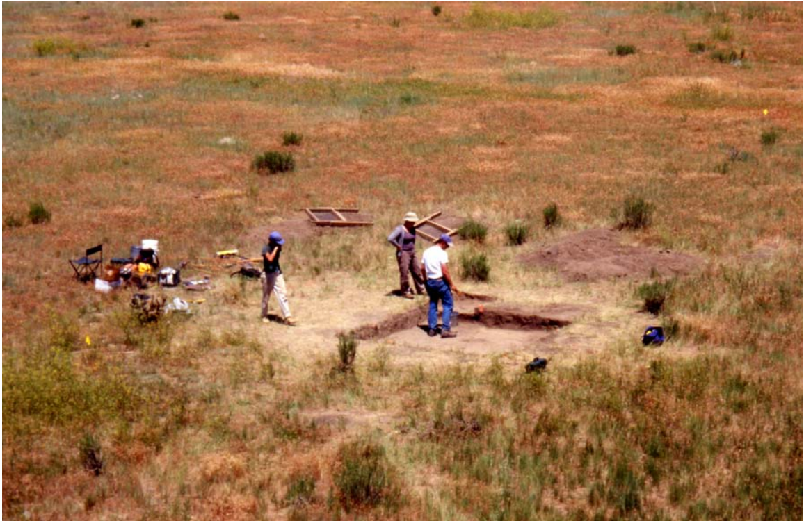
Archeological fieldwork. Excavated tent pad. Locus 1 vicinity. Photographer, Colorado Coalfield War Archeology Project, summer 1998.

National Register of Historic Places Registration Form