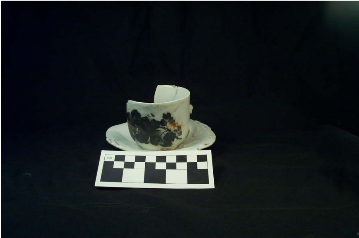
Recovered artifact: cup and saucer.

National Register of Historic Places Registration Form