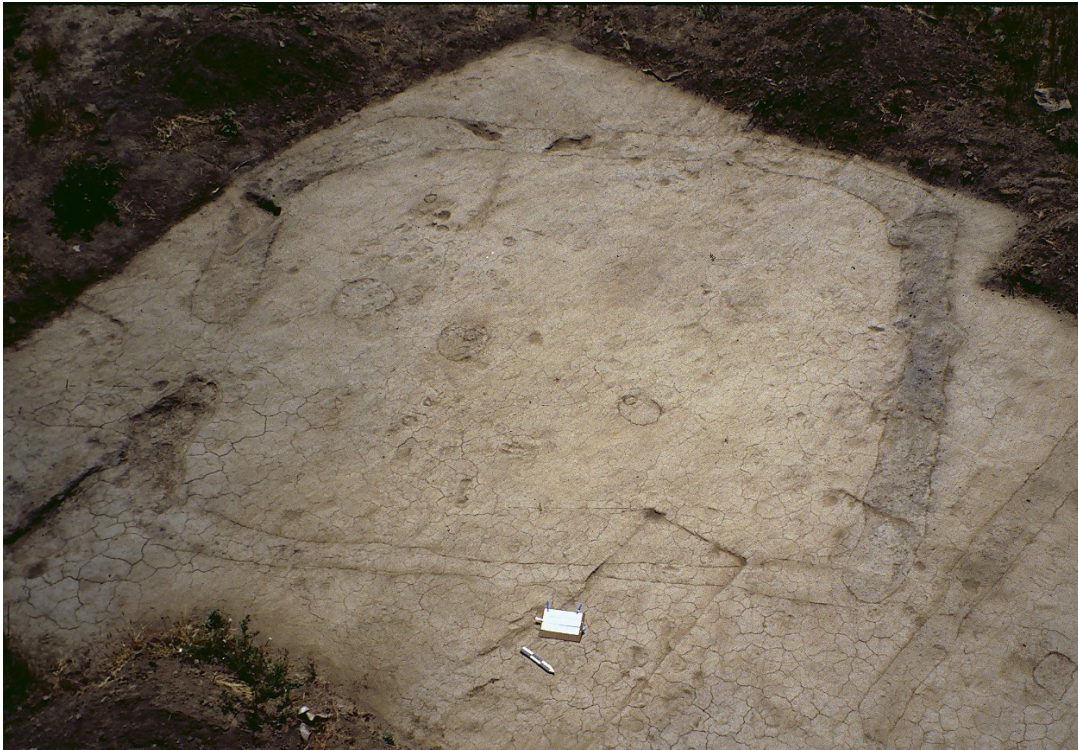
Excavated tent pad. Locus 1 vicinity. Photographer, Colorado Coalfield War Archeology Project, summer 1998.

National Register of Historic Places Registration Form