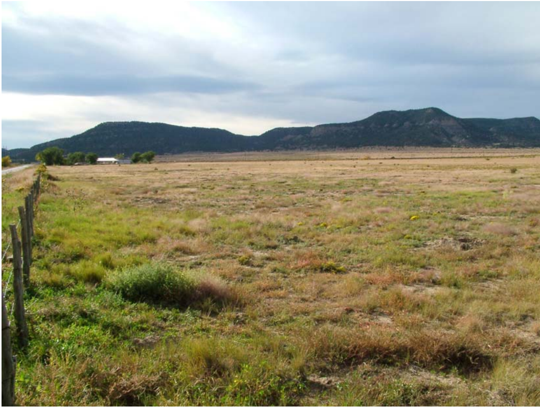
View of site from southeast corner of the 40-acre tract. Photographer, Thomas H. Simmons, October 2006.

National Register of Historic Places Registration Form