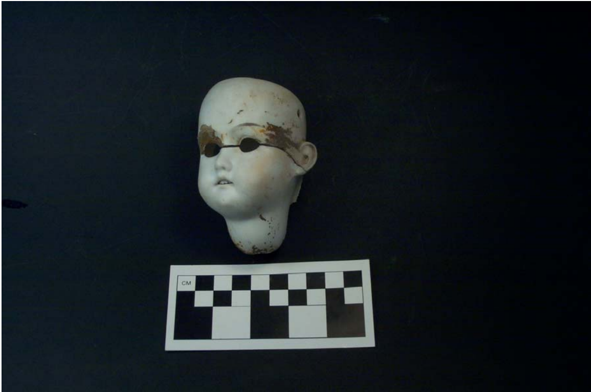
Recovered artifact: doll's head.

National Register of Historic Places Registration Form