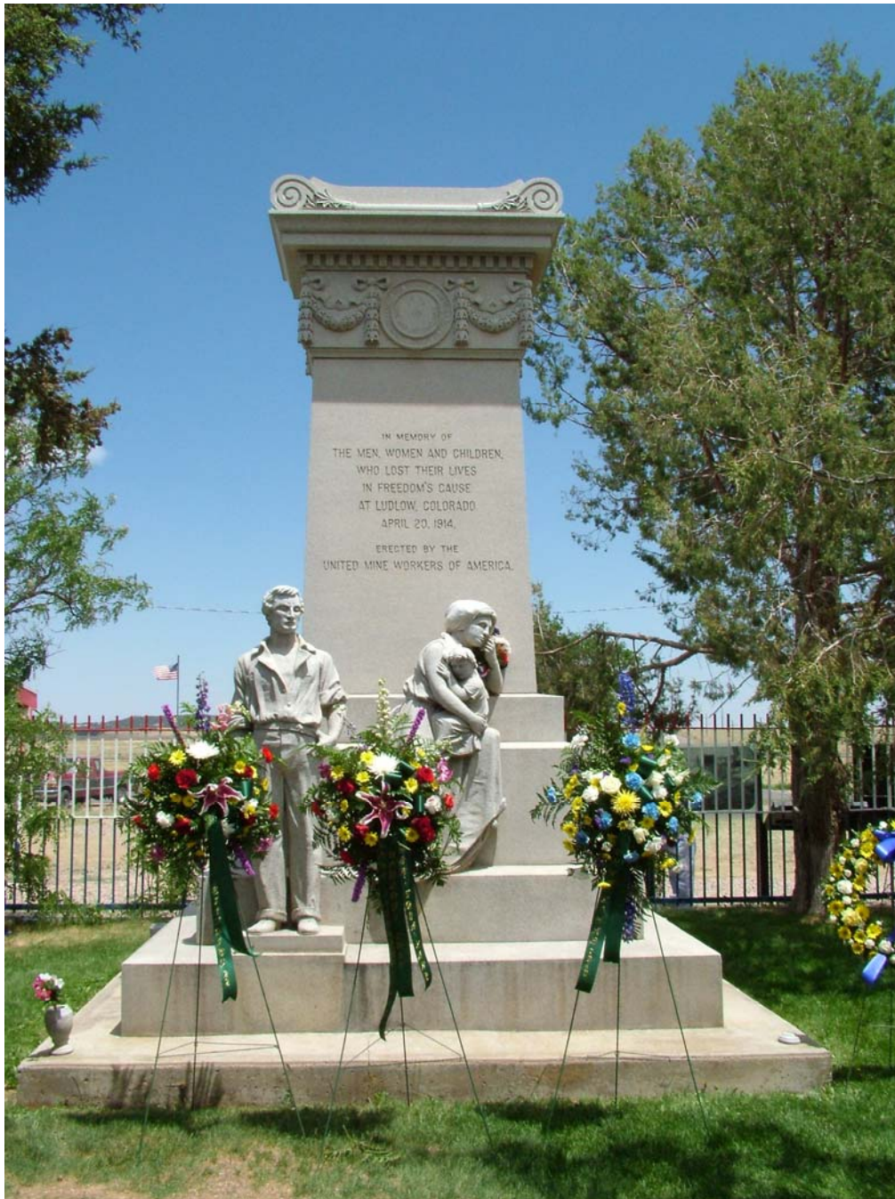
Ludlow Monument (west face) with Death Pit in foreground; inside wrought iron fence of the commemorative area.

National Register of Historic Places Registration Form