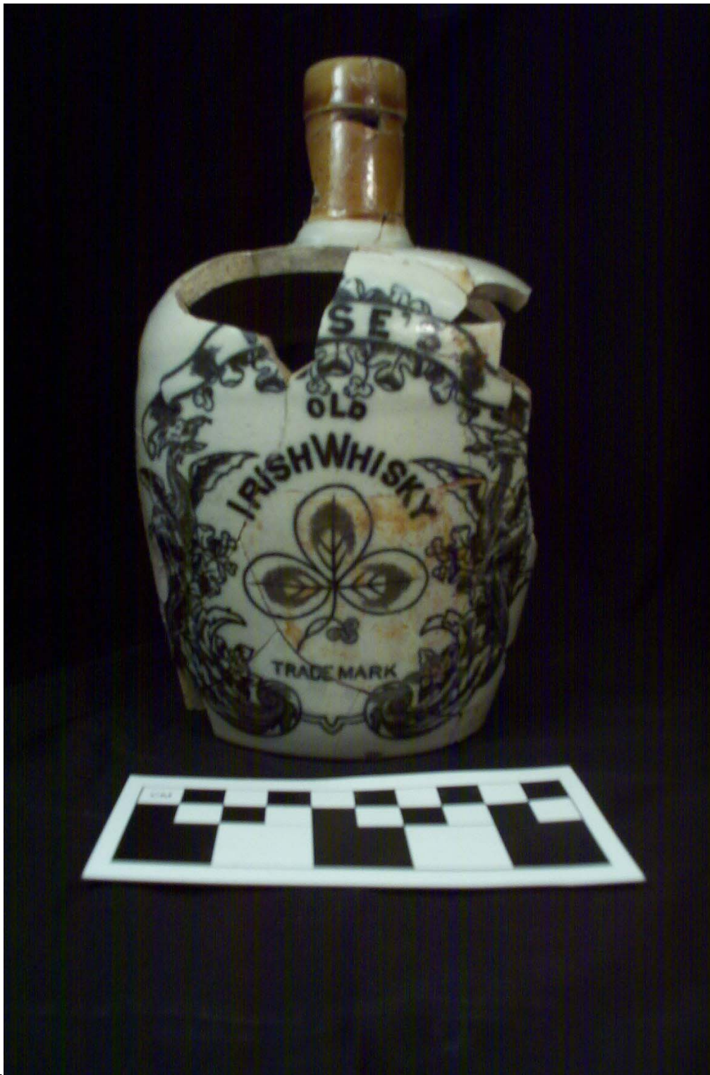
Recovered artifact: ceramic Irish whiskey bottle.

National Register of Historic Places Registration Form