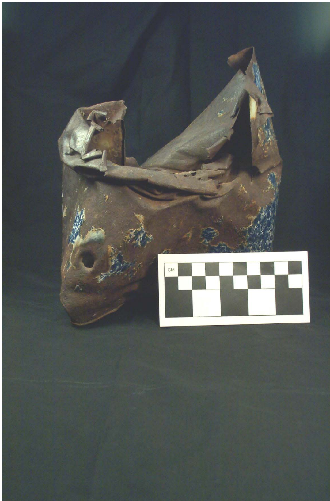
Recovered artifact: tinware with bullet hole.

National Register of Historic Places Registration Form