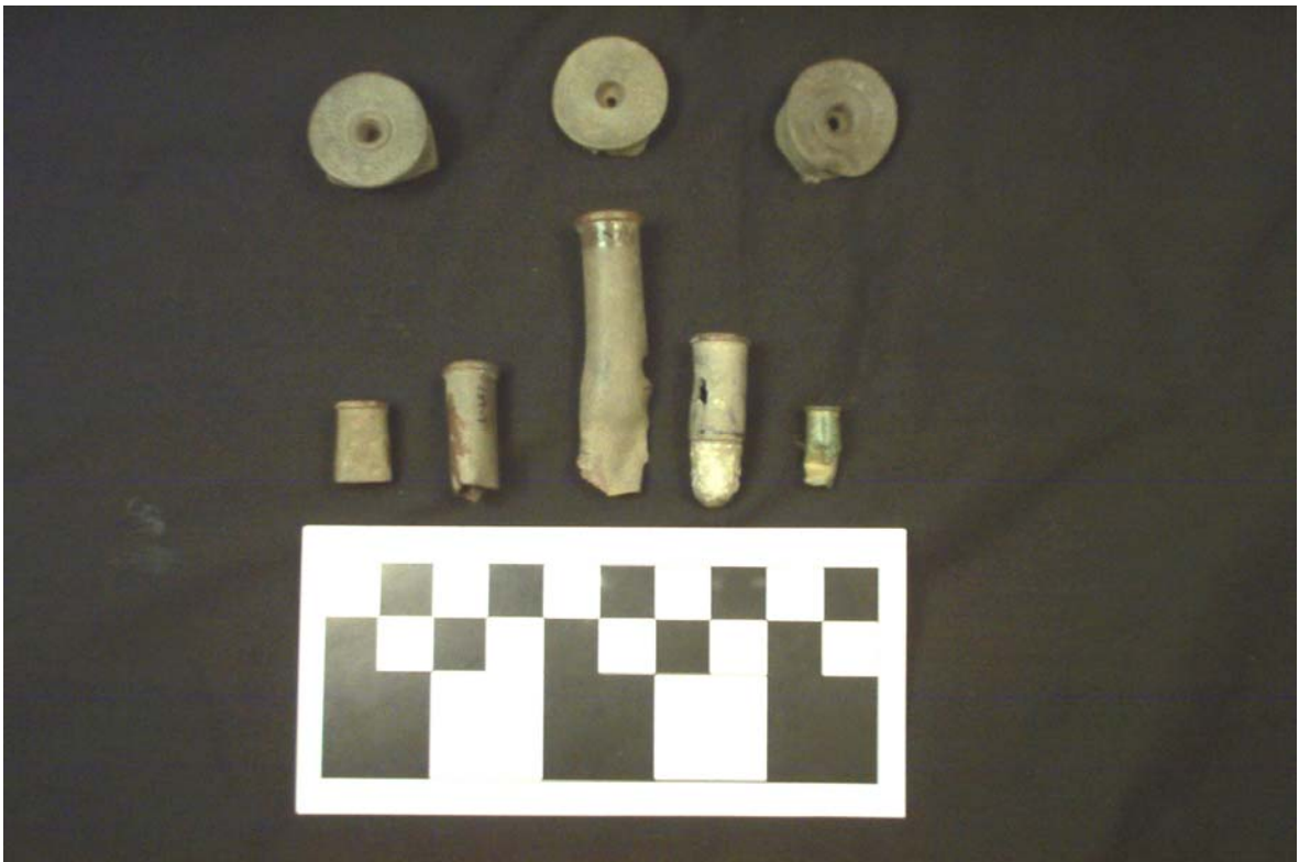
Recovered artifact: cartridge cases and bullets.