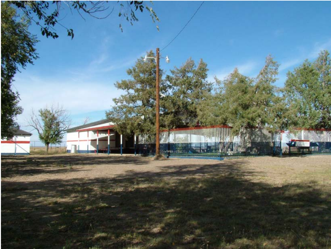
Speakers' Stand/Picnic Pavilion (right) and Well Shed (left); inside the chain link fence of commemorative area.

National Register of Historic Places Registration Form