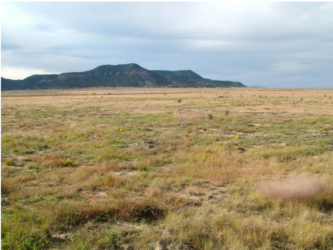
View of site from southeast corner of the 40-acre tract. Photographer, Thomas H. Simmons, October 2006.