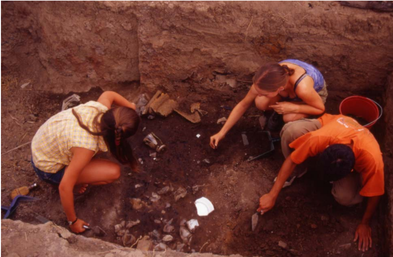
Tent cellar excavation.

National Register of Historic Places Registration Form