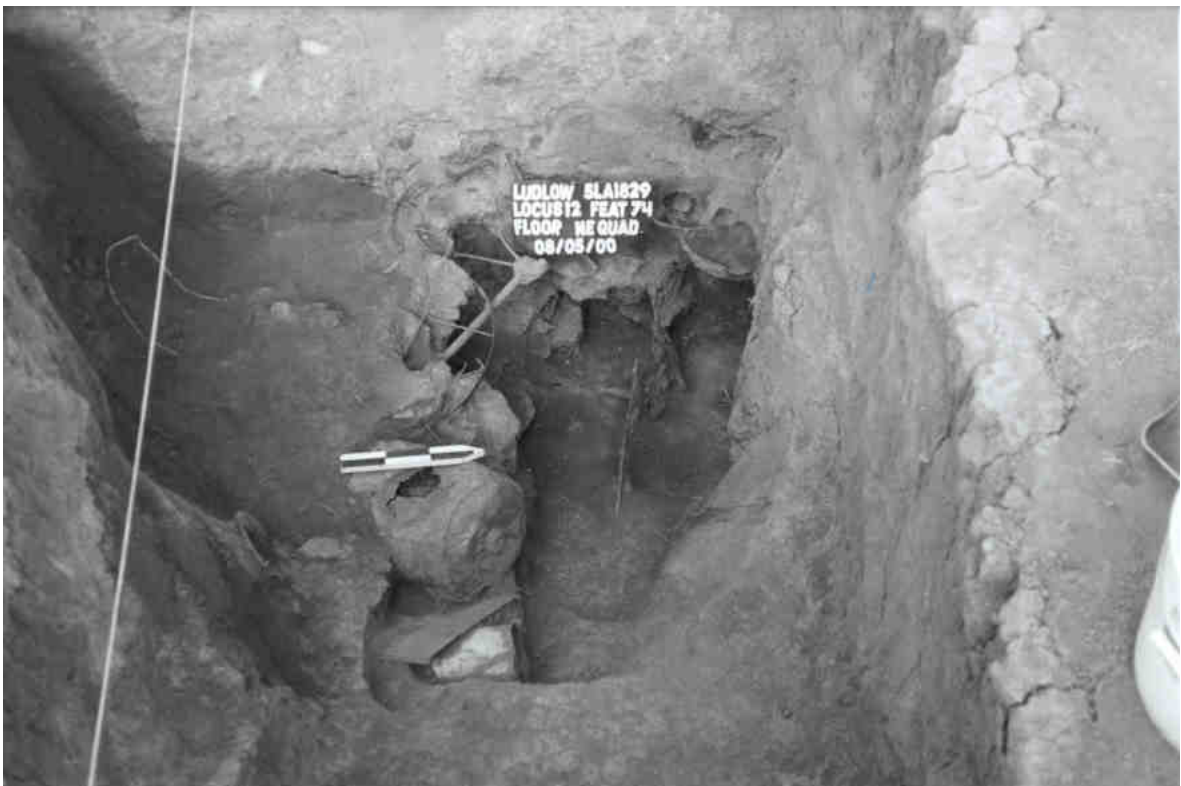
Tent cellar excavation, Locus 12, Feature 74.