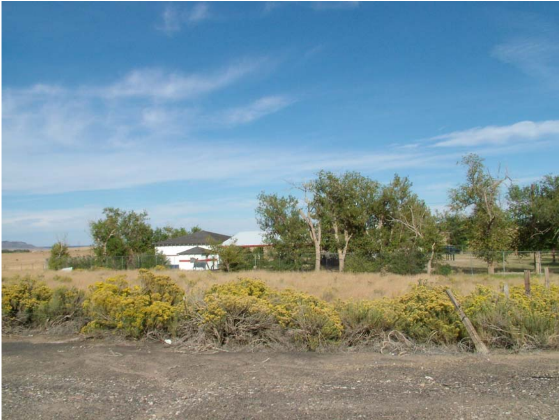
Ludlow Tent Colony Site from railroad grade to west.

National Register of Historic Places Registration Form