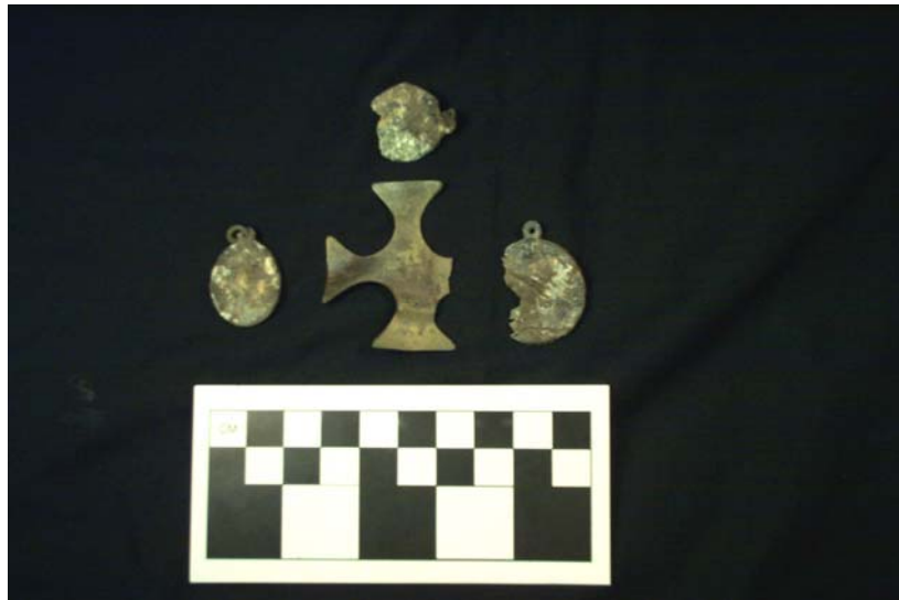
Recovered artifact: metal religious medallions.

National Register of Historic Places Registration Form