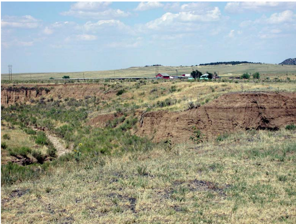
Location of trash midden near Del Agua Arroyo at the northwest corner of the parcel. Photographer, Colorado Coalfield War Archeology Project, summer 1998.