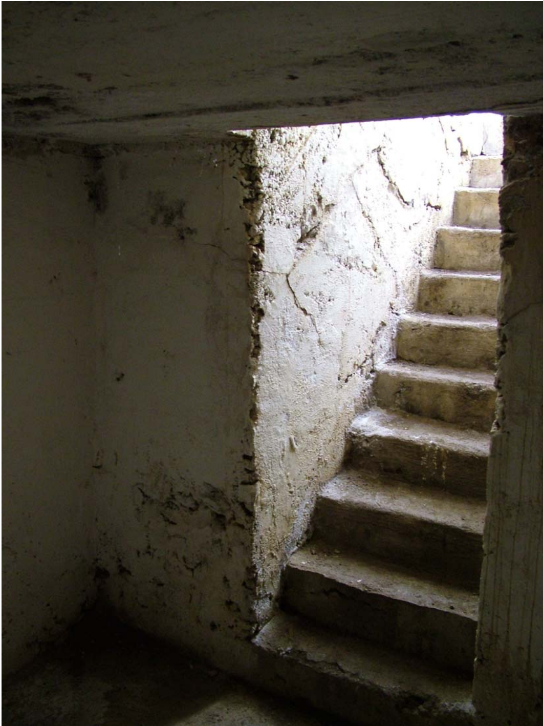
Inside Death Pit below ground; inside wrought iron fence of the commemorative area.

National Register of Historic Places Registration Form