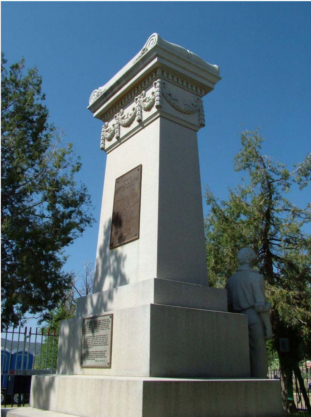
Ludlow Monument (east and north face); inside wrought iron fence of commemorative area.

National Register of Historic Places Registration Form