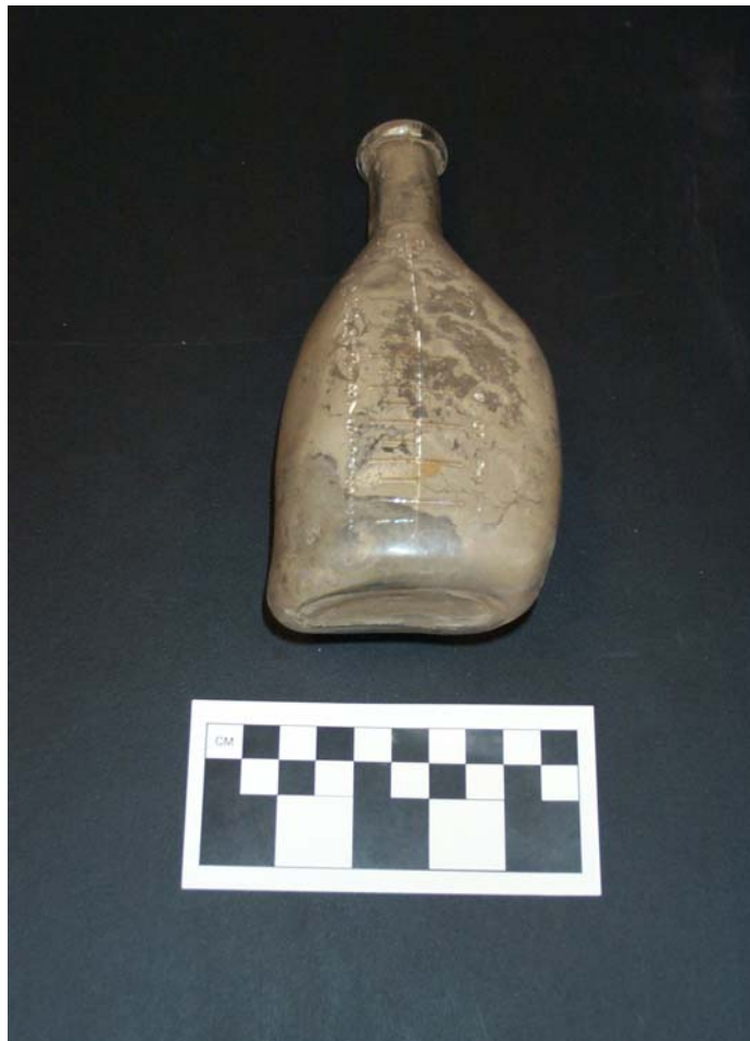
Recovered artifact: glass baby bottle.