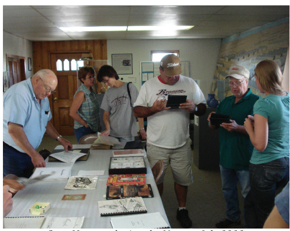
Open House at the Amache Museum, July 2008

The oral history component of research at Amache has become not only a treasured experience