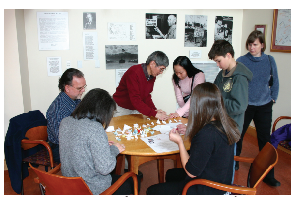
Guests learn the art of origami, Japanese paper folding.

Day of Remembrance was a wonderful success that almost 200 people attended in order to reflect, share, learn, and commit to educating future generations about internment.