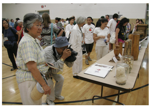
Objects from the Amache Museum on display in the Granada High School gymnasium.

The tours were a great success thanks to the hard work of many groups including the APS, the City of Granada, the Japan-America Society of Southern Colorado, Mile-Hi JACL, DU, and JANM.