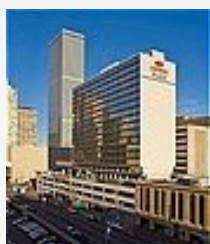
Crowne Plaza Hotel