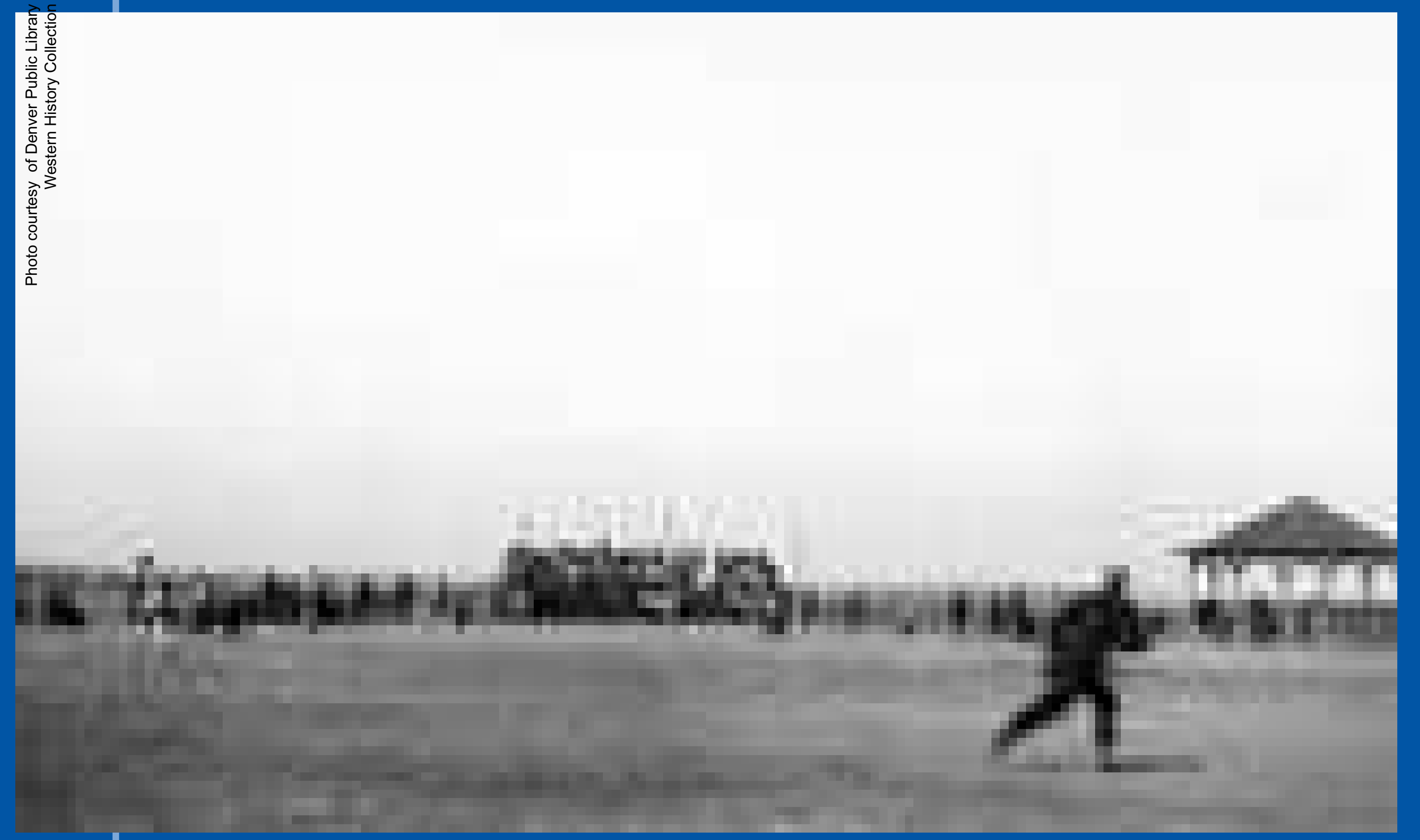
View of a ball game at the UMW camp

Because tensions between the strikers and the company had been steadily escalating, the state militia was stationed on Watertank Hill, observing the colony's activities.