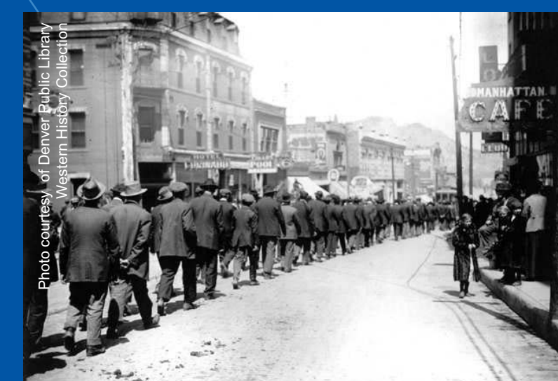
Hundreds of coal miners march in a funeral procession for Ludlow Massacre victims during the UMW labor strike against CF&I, North Commercial Street, Trinidad, Las Animas County, Colorado, 1914