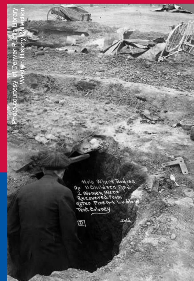
Hole where bodies of 11 children and 2 women were recovered from after fire at Ludlow Tent Colony, 1914