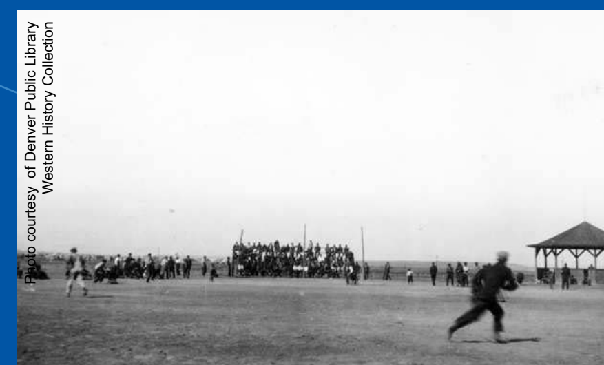
Baseball game at the Ludlow tent colony, ca. 1913