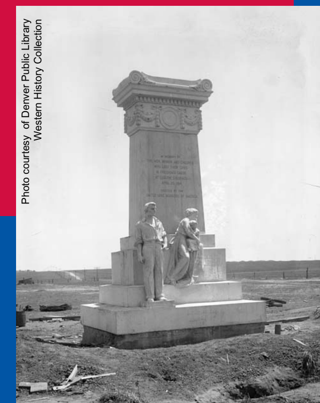
View of the Ludlow Memorial, erected in memory of the Ludlow Massacre, ca. 1920