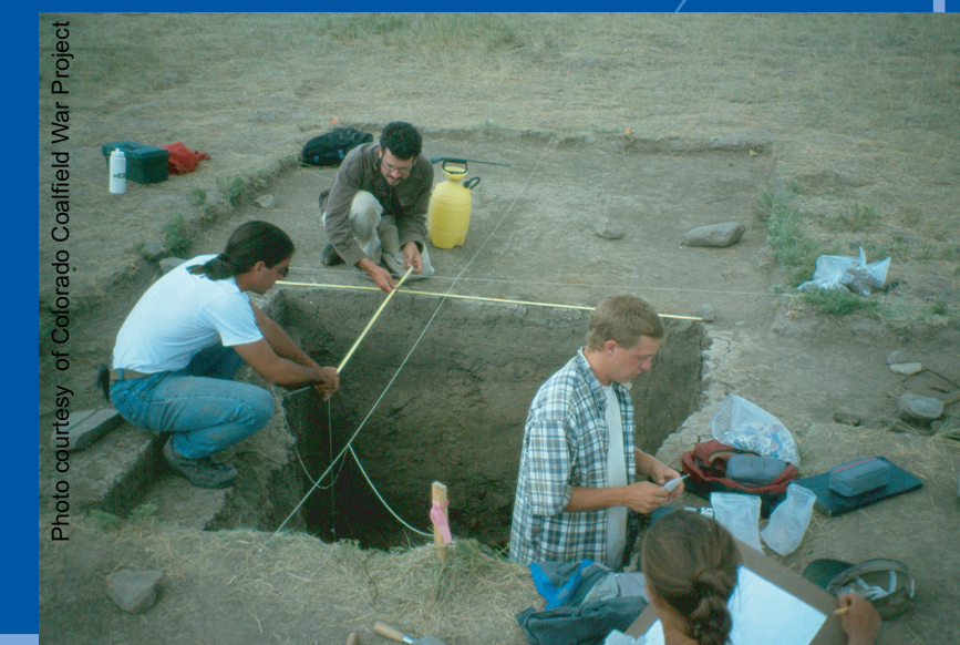
Archaeologist excavating during the summer of 2002