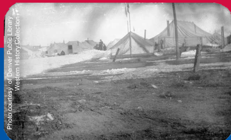
UMWA tent camp in Ludlow, Las Animas County, Colorado, 1914