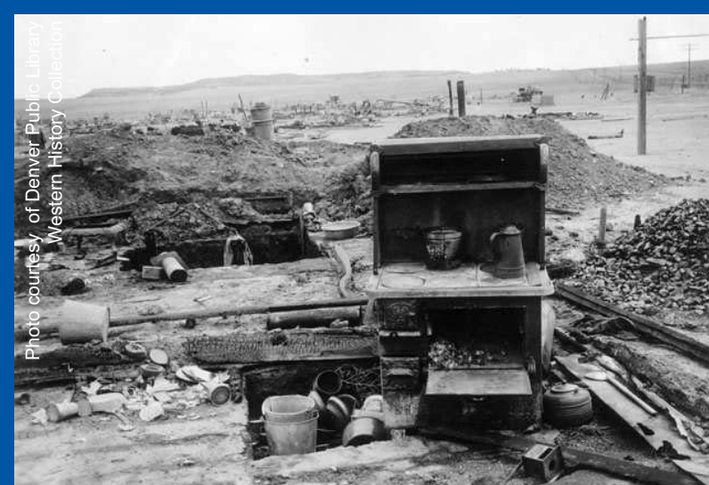
Ruins of Ludlow Tent Colony, 1914