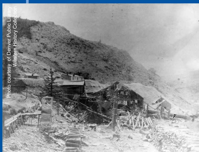
Explosion at a mining camp in Boulder County, Colorado, ca. 1890