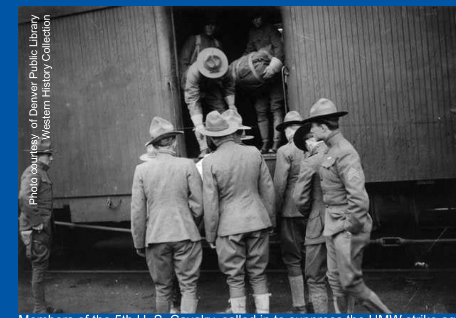
Members of the 5th U. S. Cavalry, called in to suppress the UMW strike against CF&I, unload supplies from a boxcar on the Colorado & Southern Railway near Trinidad, Las Animas County, Colorado, 1914