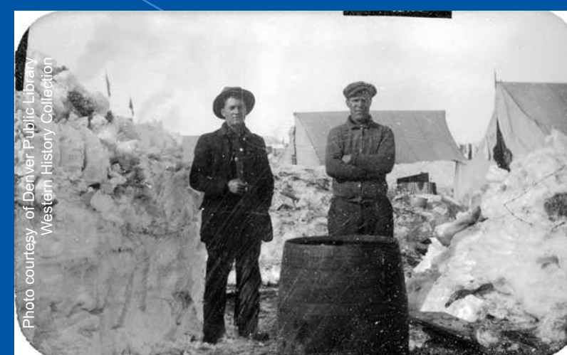
Men pose at the UMWA tent camp in Ludlow, Las Animas County, Colorado, 1914