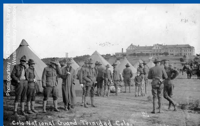
Members of the Colorado National Guard, called in to suppress the UMW strike against CF&I, stand in a camp near Mount San Rafael Hospital in Trinidad, Las Animas County, Colorado, 1914