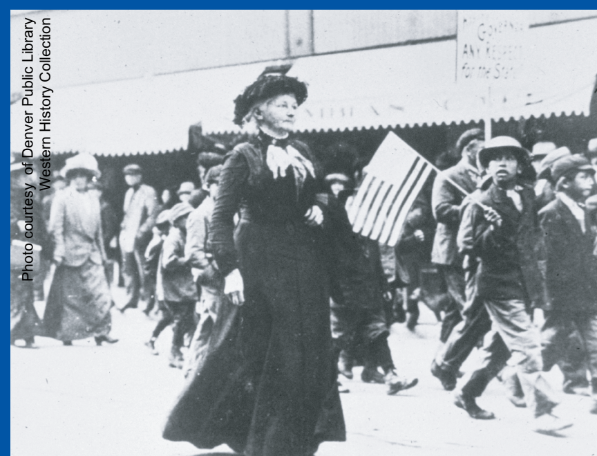
Labor activist Mother Jones marching on behalf of striking coal miners, Trinidad, Colorado, ca. 1914