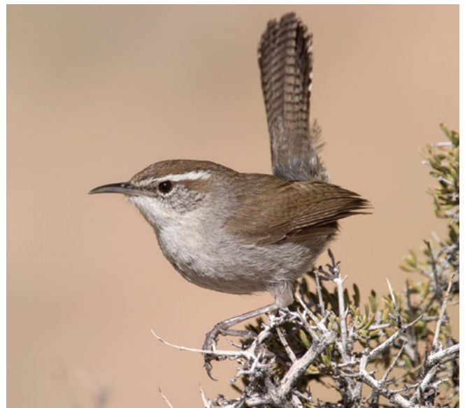
Resurveying routes taken by Joseph Grinnell a century ago, researchers have found that many bird species, such as the Bewick's Wren , have altered their distributions. Some of the distributional changes are correlated with long-term changes in temperature and/or precipitation. Kern County, California; February 2004.