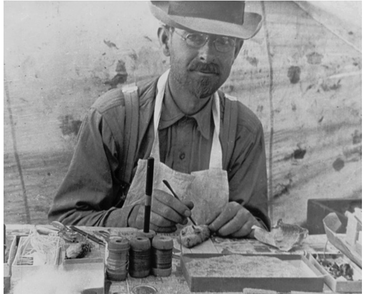
Joseph Grinnell (1877–1939) prepares a specimen in a field tent, circa 1922, during one of his pioneering wildlife surveys in California.

The authors reported in 2009 ( Proceedings of the National Academy of Sciences 106:19637–19643) that relatively high-el-