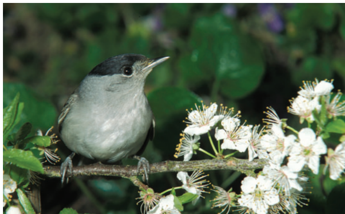
A change in migratory behavior by the Blackcap , an Old World warbler, is a dramatic example of rapid evolution. More and more Blackcaps from central Europe fly northwestward to winter in Britain instead of southwestward to the traditional winter range in Iberia. This novel, inherited trait could lead eventually to speciation. Rivières-le-Bois, Haute-Marne, France; 6 August 2003.

In their report in Science , Bearhop and his coauthors announced that they had found ideal markers: stable hydrogen isotopes recently synthesized in Blackcaps' new claw tips. Isotopic ratios vary geographically, reflecting the amount of rainfall absorbed by plants and passed up the food web. The isotopic "signature" shows where tissues were grown—in this case, whether a breeding Blackcap in central Europe had wintered in Britain or in Iberia. These isotopes produced the long-awaited evidence. Blackcaps