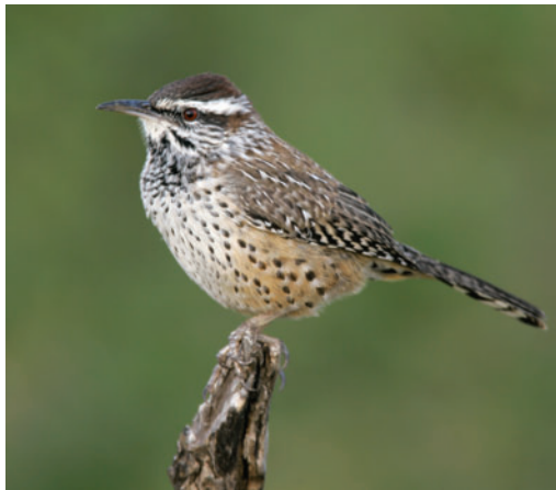
Recognized subspecies may differ morphologically from other subspecies, yet may not be evolutionarily distinct. For example, Robert M. Zink found that six Cactus Wren subspecies form only two genetically distinctive groups. As a general rule, Zink believes that conservation should focus on independent evolutionary units rather than on individual subspecies. Starr County, Texas; November 2004.

named subspecies that may reflect trivial morphological differences. He granted that many species show geographical variations in morphology that might be local adaptations important to the survival of the species. But these variations, he said, can change rapidly, while genetically distinct taxa often take tens of thousands of years to evolve. Applied to the Cactus Wren, his view is that the continental and the Baja populations merit conservation attention at the group level but that the individual subspecies do not. (The severely declining sandiegensis subspecies, an ecologically separate population inhabiting southern California's coastal sage-scrub, was not examined.)