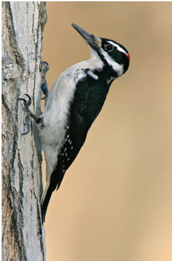
Hairy Woodpecker and Downy Woodpecker are extremely similar in plumage, but a genetic study shows that the two species are not close taxonomic relatives. Authors of the study suggest that the similarities result from evolutionary convergence. Kern County, California; January 2005.

What selective advantage might drive convergent evolution of nearly identical characters? In 1969 Martin L. Cody noted that such resemblances typically involve sympatric species whose ecological requirements overlap. He proposed interspecific territoriality as the selective force—the advantage being mutual recognition of the other species as a direct competitor for resources, which should be excluded aggressively from one's territory ( Condor 71:222–239). Cody did not discuss Downy and Hairy Woodpeckers, but the striking parallels between east-to-west plumage variation in both species