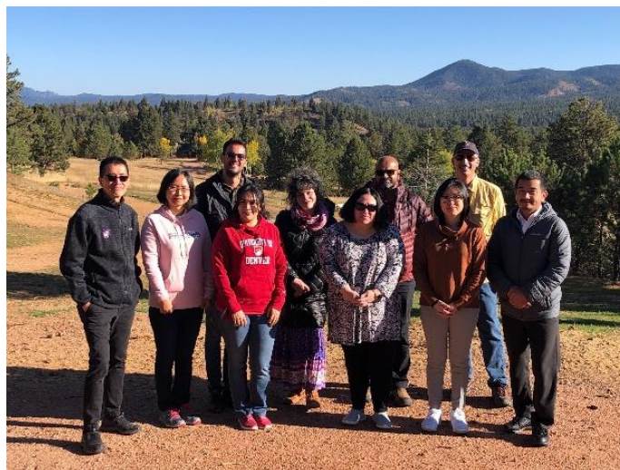
JDP Students and faculty at the A Part yet Apart Retreat

This not-for-credit certificate of completion is designed to provide and document additional teacher training and preparedness for a faculty position. It becomes part of the student’s teaching portfolio and can be made available to prospective employers. This certificate supplements the required Pedagogy course. As a certificate of completion, it does not certify a particular level of achievement and is not included on the academic transcript. The certificate is offered in partnership with DU's Office of Teaching and Learning (OTL). For more information, please see the JDP Portfolio page .